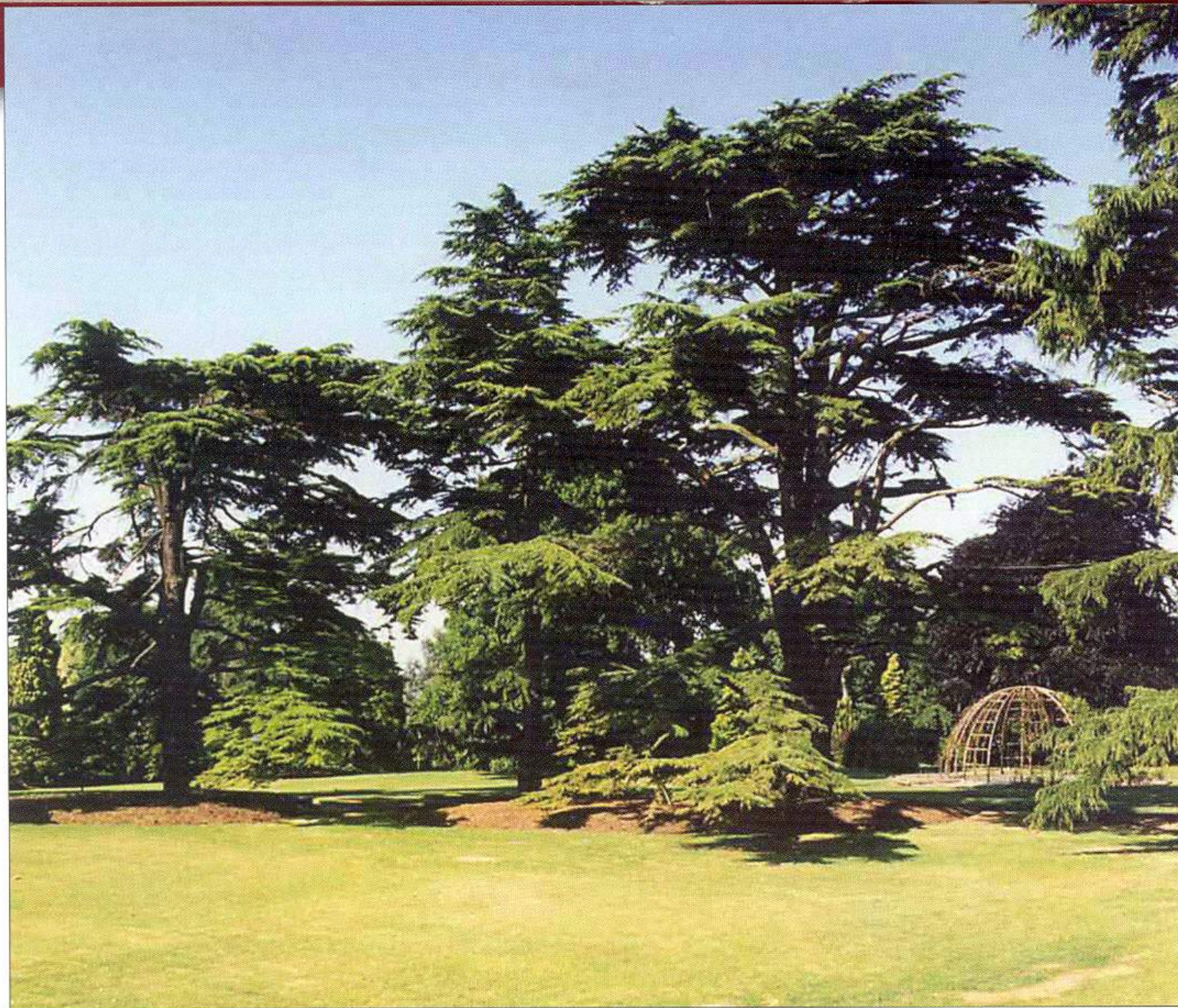
STATELY CEDARS such as these on the former Ambassador College campus in Bricket Wood, England, symbolize God's view of His saints.

Consider what this means for us today. When Ezra and Nehemiah built the temple, they built the altar first . That symbolizes the fact that God builds His ministry before calling the people into the temple. The firstfruits will be God's king-priests—His altar for all eternity. So today God is building His altar, before He builds His temple in the World Tomorrow. We need to be getting ready, because many will emerge from the worst suffering this world has ever known, and they will need to be taught. After experiencing nuclear, chemical and biological warfare, they will realize their need for true education. There will need to be spiritual Jews right there to teach them.