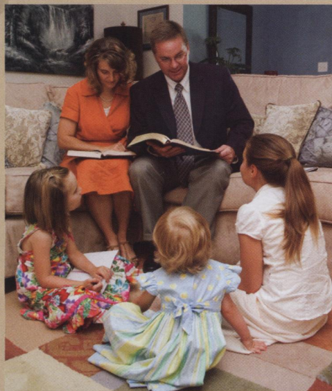
COVER STORY | Page 12