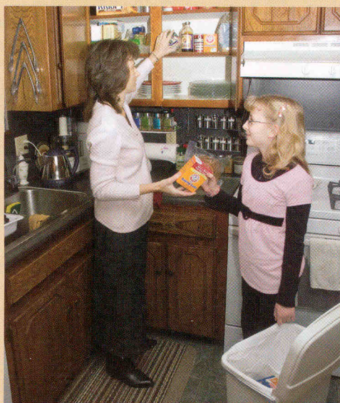
COVER STORY | Page 8