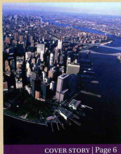
COVER STORY | Page 6