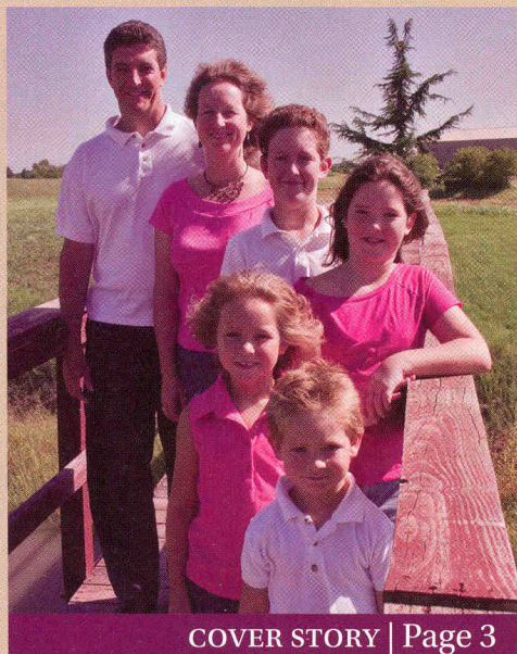
COVER STORY | Page 3